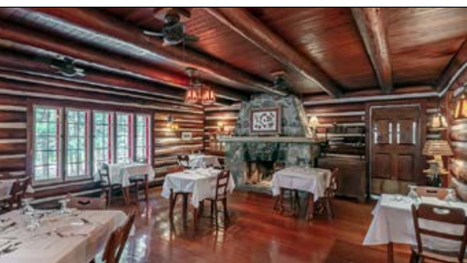
Our log dining room with space to spare.

We put health as the top priority, often exceeding any regulation that appeared yet making sure it dovetailed with the customary comfort we provide for our guests. By their nature, our cabins are private and