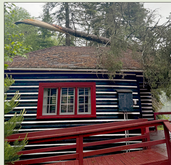
A pine on the roof of Cabin 3, a casualty of the storm.

We were lucky that damage was minimal and no one was hurt. We'll certainly remember the wildest weather to ever hit Killarney Lodge!